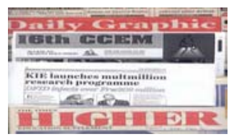
Some of the News communications featuring EdQual

TV has increasingly become the best channel for reaching large audiences of students, parents and teachers. Local language newspapers are read widely in urban areas. However, articles targeted at policymakers are best placed in key national English language newspapers. In Ghana the University of Cape Coast has done this successfully, placing articles in the Daily Graphic and Ghanalan Times highlighting the need for leadership training for head teachers.