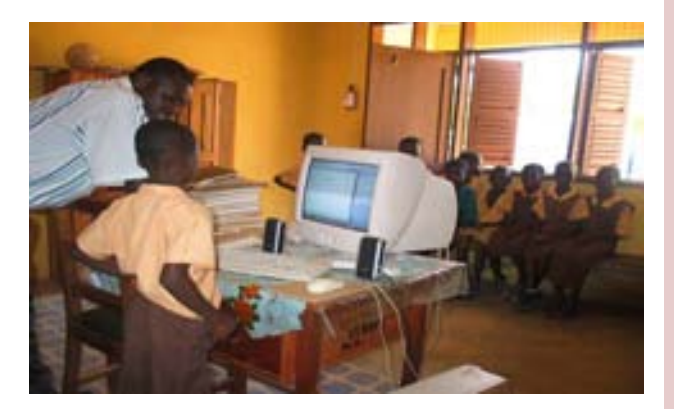
At a primary school in Ghana, the teacher demonstrates on the only PC available while pupils wait their turn

As circuit supervisors, they note that they can support the head teachers by increasing their supervisory role, and building the capacity of the heads in relation to managing the school. They also emphasize the need to create awareness among the teachers that the head teacher is the circuit supervisors' representative and the sole supervisor of the school.