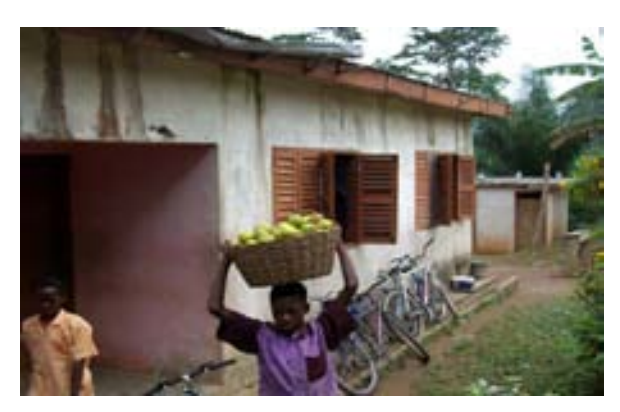
A house for nine teachers in Tanzania

She saw the problem as a difficulty in learning English, or the matter of choice on what should be the language of instruction.