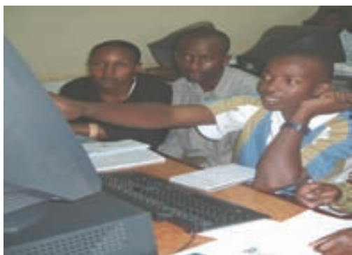
ICTs in Rwanda

Case studies were presented studying how various technologies, e.g. mobile phone, whiteboards, computers, have been exploited in informal learning (online learning) and formal learning. These presentations emphasized the role of the convenor/teacher in ensuring effective learning. Case studies were conducted in developed as well as in developing countries and in differing social-economic contexts.