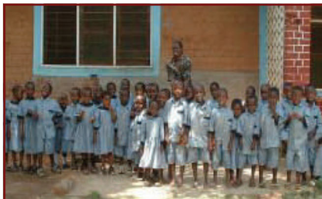
Primary School in Songea Town, Tanzania