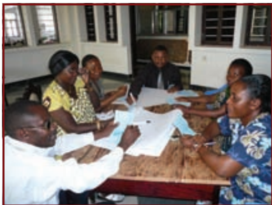
L&M Needs Analysis Workshop, UDSM Tanzania

Not unsurprisingly, it was clear that head teachers spend much of their time mobilising funds and resources for their schools. Enrolling children into grade 1 is also time-consuming. However, they still had their eye on the ball when it came to academic performance. They also recognised that children have physical and affective/ psychological needs as well as cognitive learning needs. Some participants stressed the importance of a "child-friendly school environment" and gave some thought-provoking elaboration on what this means.