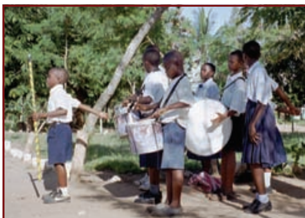
Mwanambaya Primary School Band, Tanzania

The school should have the capacity to counsel traumatized or disturbed children. Pupils' problems, including affective problems, can be discussed with parents. Some parents need to be advised on how to recognise when their child needs medical attention. Finally, we may be able to provide practical assistance in small ways, for example, by giving pens, books and uniforms to children most in need.