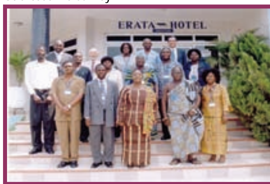
Participants at the National Consultative Meeting, Ghana

With the proposal finalised and a meta-analysis completed, the Leadership & Management project started data collection with two parallel Needs Analysis Workshops for head teachers held in March 2007. In total, 240 head teachers from all six regions attended the two workshops, one at Cape Coast and the other at Tamale in the North of the country. The workshops aimed to, and succeeded in, creating the opportunity for preschool and primary school heads tell their part of the story, and to identify, discuss and analyse challenges they encounter. Within the next month, researchers will pilot a baseline survey