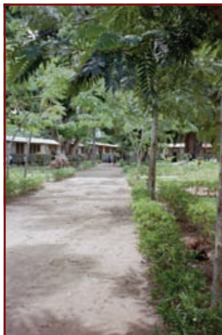
Kibaha Primary School, Tanzania

We need to establish and maintain communication channels with pupils, parents and teachers, for example, through visiting parents and pupils at home and talking to pupils in school meetings. (cont. page 3)